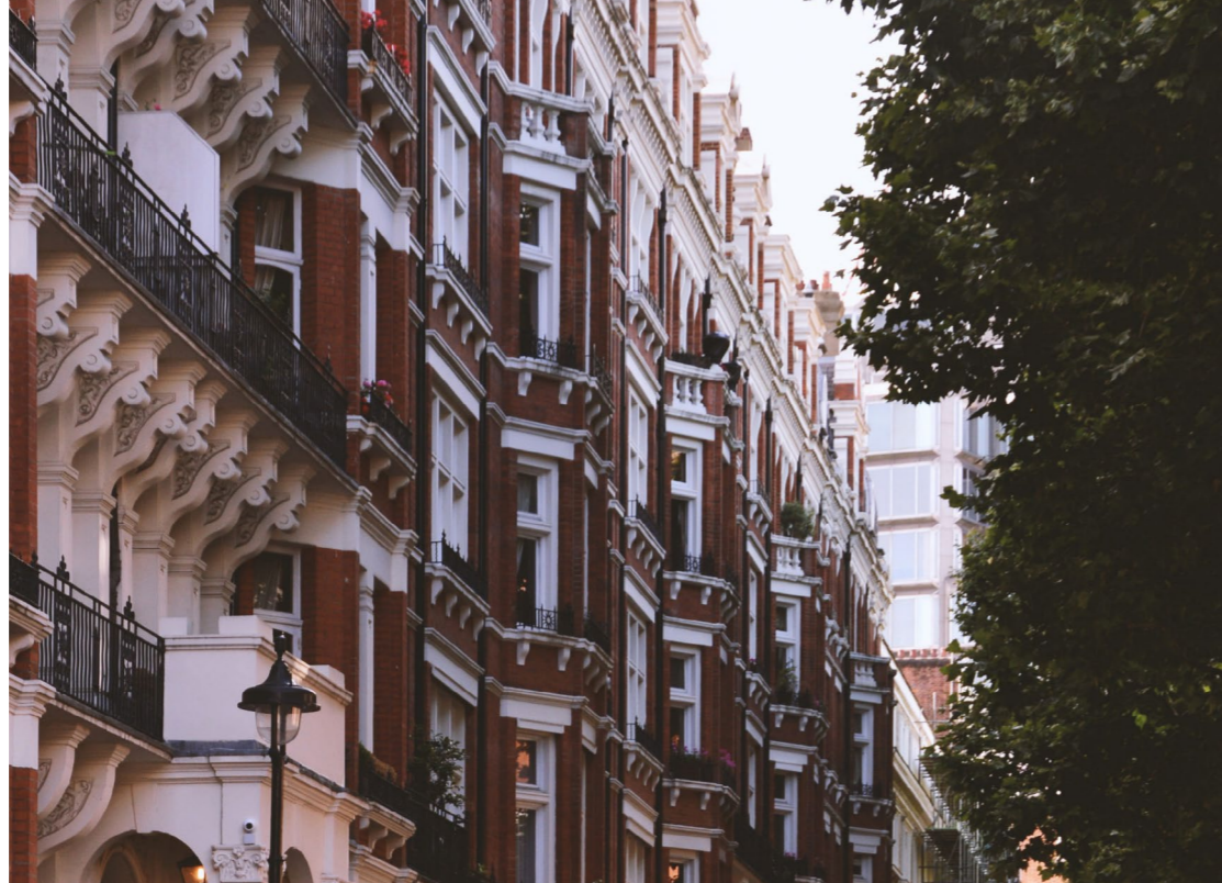
MULTI-MILLION-POUND PRIVATE RESIDENCE, CENTRAL LONDON