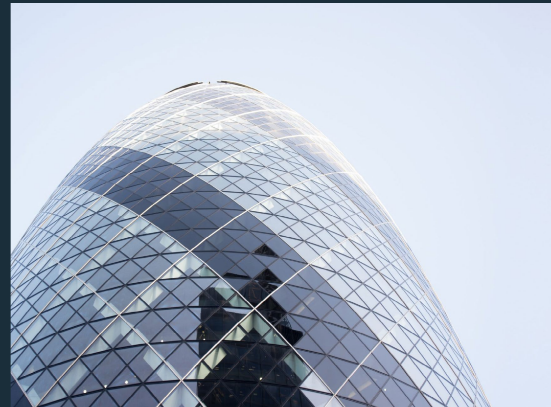
HIGH-RISE CORPORATE HQ FOR GLOBAL FINANCIAL INSTITUTION